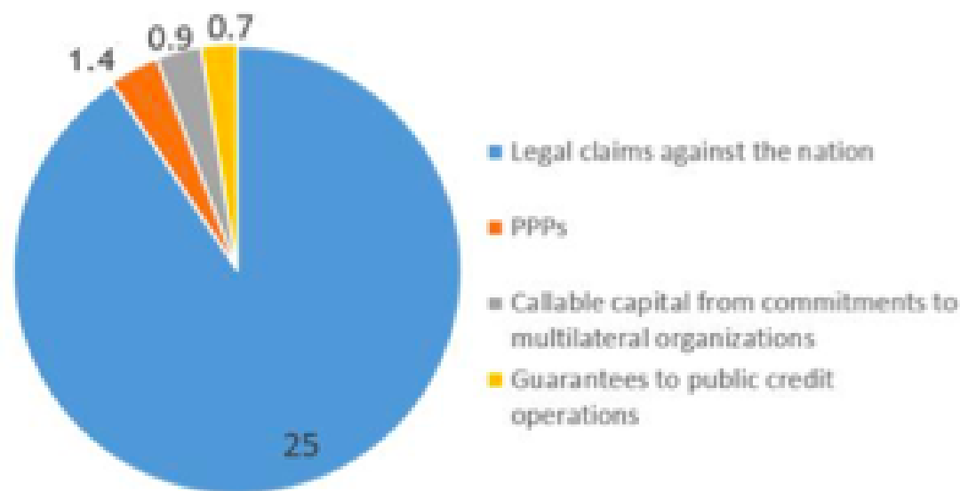
Figure 3.1: Stock of four types of explicit contingent liabilities in Colombia (in USD bn.) 34